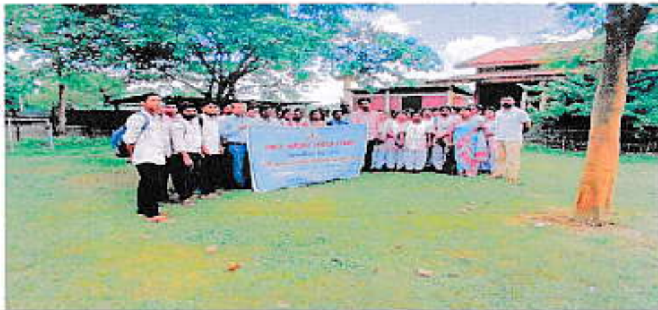
Fig. 2: Internal Evaluation of Assamese Department by External Expert