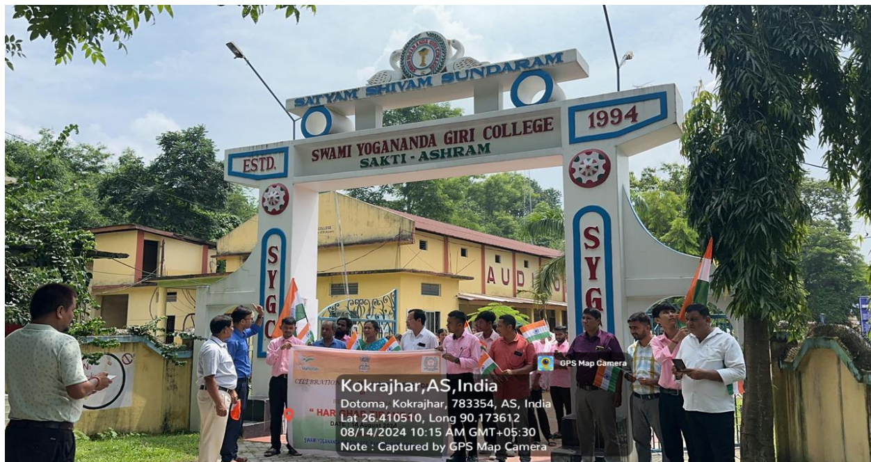
A glimpse of the Har Ghar Tiranga event organised by Swami Yogananda Giri College