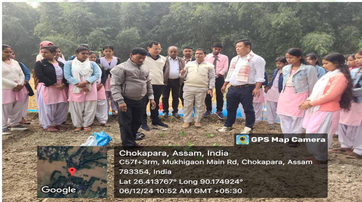
A Snapshot of inauguration of Mission Organic as Best Practice of Swami Yogananda Giri College

Published by, Internal Quality Assurance Cell & Prospectus Committee Swami Yogananda Giri College Saktiashram, Kokrajhar