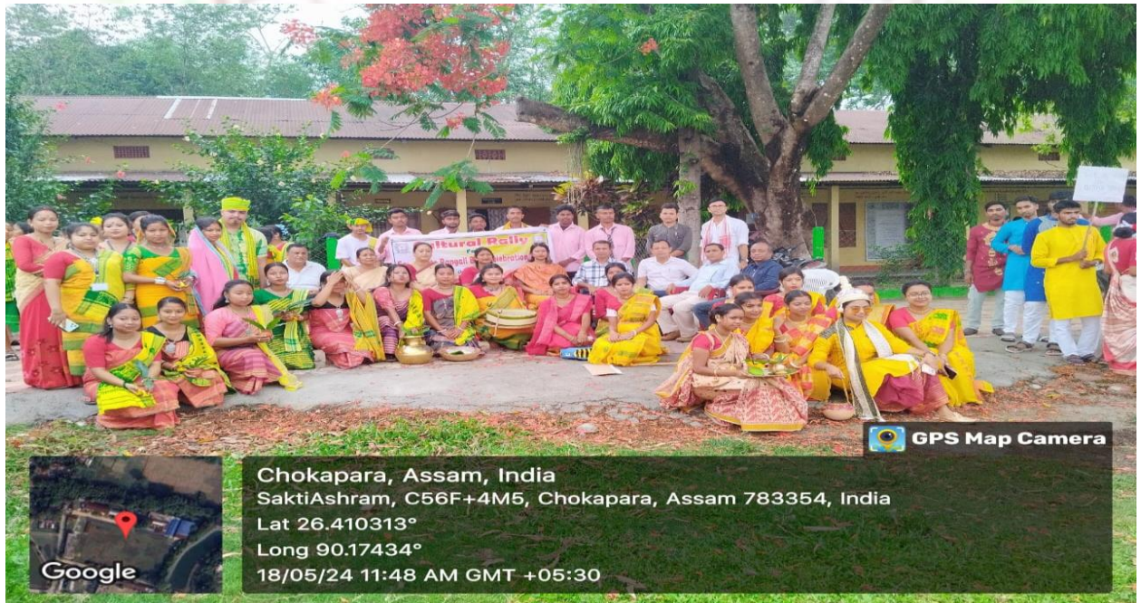
A Snapshot of cultural rally of Swami Yogananda Giri College