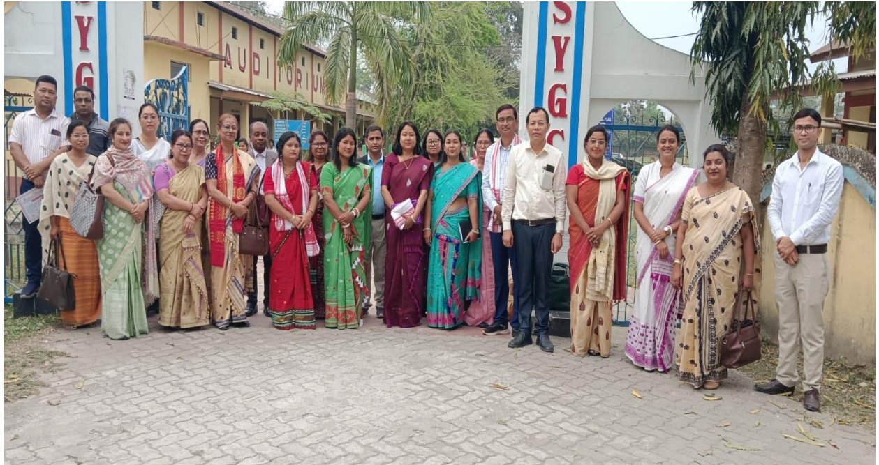
A group photo click on the day of State Level Women Conference that was held on 12 th March, 2025